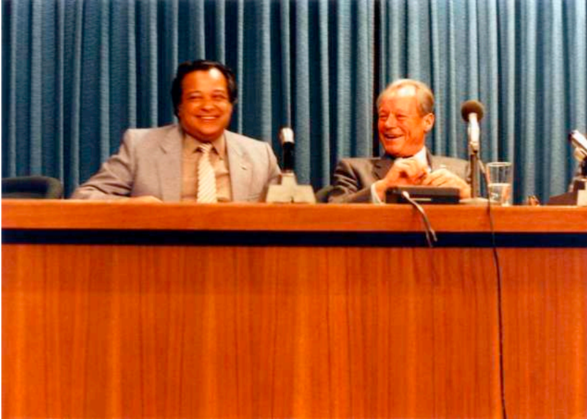
Figure 9.5 Crossing the finish line the second time with a laughter. Shridath Ramphal and Willy Brandt in Ottawa in December 1981 after the adoption of the text for Report 2.