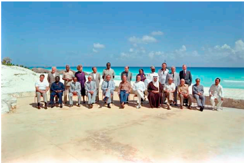
Figure 9.2 Heads of State and Government at the Cancún North-South Economic summit on the beach for a photo 23 October 1981. From the left front row Ronald Reagan (USA), Simeon Aké (Côte-d'Ivoire), Abdus Sattar (Bangladesh), Chadli Bendjedid (Algeria), Hans-Dietrich Genscher (FRG), Pierre Trudeau (Canada), Jose Lopez Portillo (Mexico), Prince Fahd (Saudi Arabia), Ramiro Saraiva Guerreiro (Brazil), Zhao Ziyang (China), Ferdinand Marcos (Philippines). Back row: Sergej Kraigher (Yugoslavia), Julius Nyerere (Tanzania), Margaret Thatcher (UK), Zenko Suzuki (Japan), Forbes Burnham (Guyana), François Mitterrand (France), Indira Gandhi (India), Alhaji Shehu Shagari (Nigeria), Torbjörn Fälldin (Sweden), Luis Herrera Campins (Venezuela), Kurt Waldheim (UN).