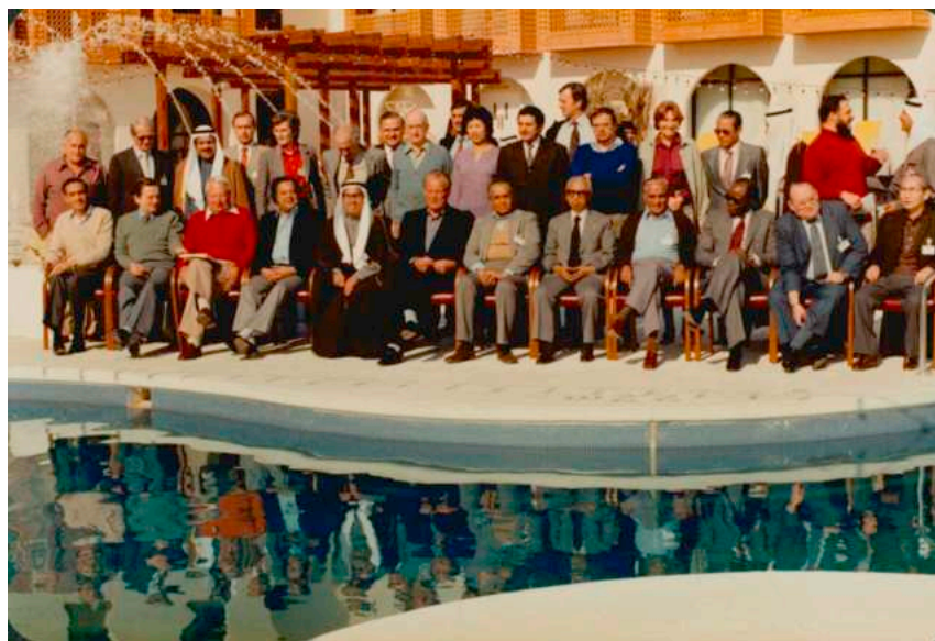
Figure 9.4 The Brandt Commission met in Kuwait in January 1982 and decided to proceed towards a second report. ARAB, Stockholm.

A year after Cancún, the radical market liberal ideas that hovered over summit became more potent. They forced the commission to retreat from its bold vision aimed at 2000 to a defence of its emergency program aimed at 1985. At the same time, the language shifted from utopian to apologetic. The titles of the reports, A Programme for Survival and Common Crisis , reflected the change. Three years after the publication of the first report, the global economy's prospects were even darker. The colour of the cover of Common Crisis was black: black for death and mourning. The cover of A Programme for Survival was red: red for action. It is unclear whether there had been any conscious thought behind the choices, but the reader could not avoid seeing