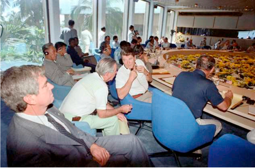
Figure 9.3 Cancún Sheraton Beach the meeting room. Ronald Reagan conferring with his treasury secretary Donald Regan.

The morning session on 22nd October was formal with prepared official statements. Then the discussion began. There were some moments of tension, but the talks were mainly informal and fluid. Leaders talked and listened and addressed each other using first names. Additional to the group sessions were twenty to thirty-minute bilateral appointments. Reagan met with the heads of state of all the developing countries, and this attentiveness impressed them. The other G7 leaders held three or four such meetings each. Nyerere was particularly insistent on the need for a new world order with better terms of trade and credit conditions for the South in his discussion with Reagan. A few days before the meeting, Mitterrand had sent a letter to the co-chairs, Portillo and Trudeau, proposing a focus on two issues: the establishment of an energy affiliate to the World Bank and the opening of global negotiations before the end of the year. These were core demands of the developing countries. 13 So representatives of the Left, both from the South and the North, had high hopes for Mitterrand, but in the end, he disappointed them by maintaining an astonishingly low profile.